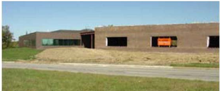
National Grain Center in Kansas City